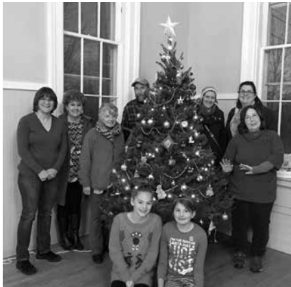
DTC (Willington Democratic Town Committee)